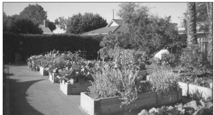
Overflowing vegetable garden